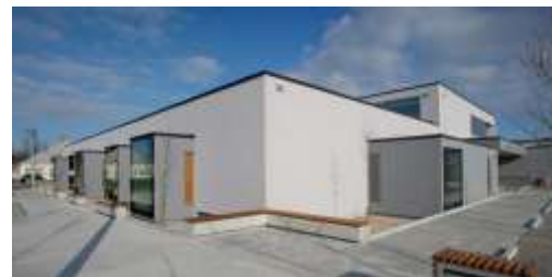
Ballyroan Library, Orchardstown Avenue, Rathfarnham, Dublin 14